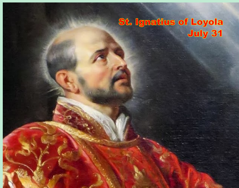
St. Ignatius of Loyola July 31