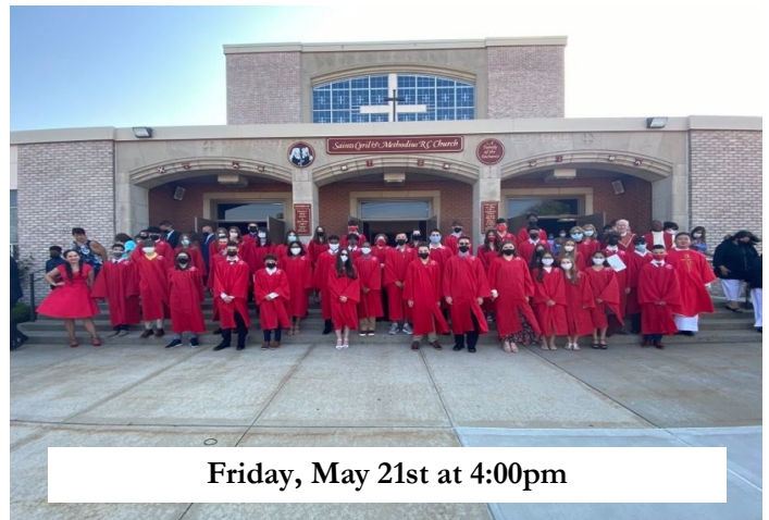
Friday, May 21st at 4:00pm