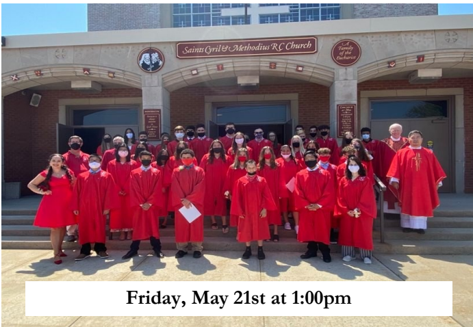
Friday, May 21st at 1:00pm

I am SO PROUD of all of my Level 8 students and the young men and women that they have grown up to be, and I am so excited to see how they use their newly-bestowed Gifts and what they do for our Catholic Church! Thank you so much for all of your prayers during this time; I have been feeling them all month long, and I know that our Confirmandi have, too! Be sure to check out our Instagram for all of our photos from our big day; If you have a Confirmation student, remember to tag us in your posts and stories so that we can share what Confirmation Day looks like through your eyes!