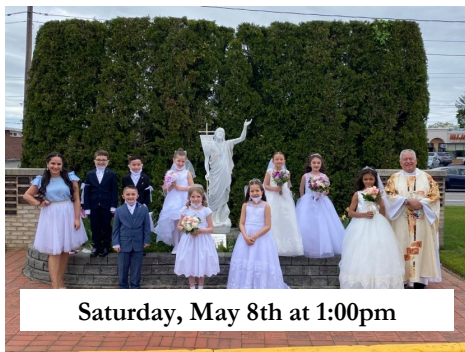
Saturday, May 8th at 1:00pm