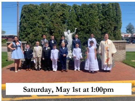
Saturday, May 1st at 1:00pm