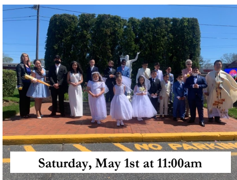
Saturday, May 1st at 11:00am

We have officially completed all of our First Holy Communions for our students! I am SO PROUD of them, and am so thankful and grateful for such beautiful days; From great weather to sharing these days with all of our students and their families, all six sessions were absolutely perfect and filled with so much joy. Thank you so much for all of your prayers; I have been feeling them all month long! Be sure to check out our Instagram for all of our photos of our big days; If you have a First Holy Communion student, remember to tag us in your posts and stories so that we can share what First Holy Communion looks like through your eyes!