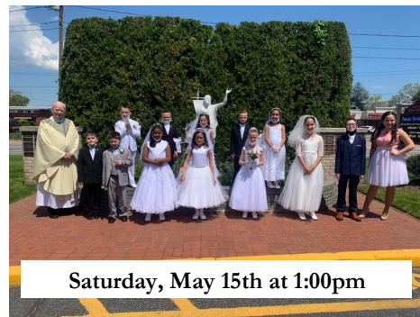
Saturday, May 15th at 1:00pm