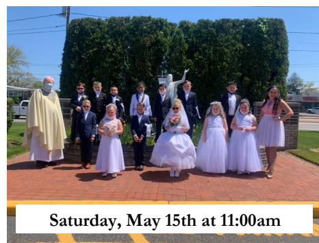
Saturday, May 15th at 11:00am