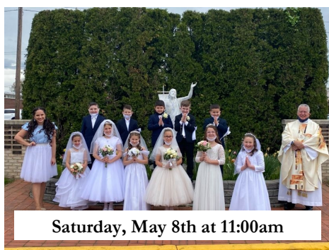
Saturday, May 8th at 11:00am