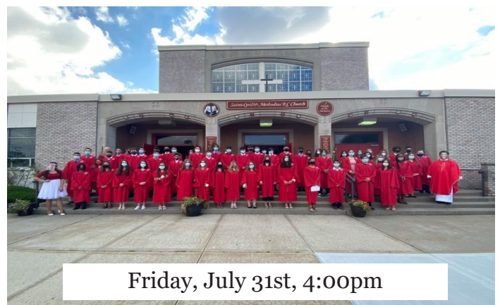
Friday, July 31st, 4:00pm