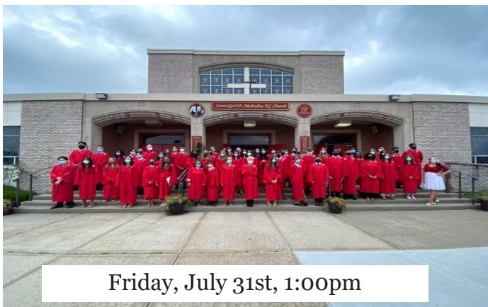
Friday, July 31st, 1:00pm

I am SO incredibly proud of all of our Confirmandi, their hard work, and their maturity to be ready for this day after months of waiting, especially in this current climate. That is the true Gift and Power of the Holy Spirit. I am so thankful that this day could finally take place, and am so excited to see what our newest fully-initiated Catholics will bring to our Church! Congratulations to all of our students and their families on this truly incredible day!