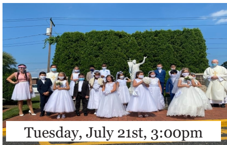
Tuesday, July 21st, 3:00pm

On Tuesday, July 21st, Thursday, July 23rd, and Friday, July 24th, we were FINALLY able to celebrate all of our Level 2 students! We held six Masses for all of our students to make the Sacrament of First Holy Communion both safely and socially distant for everyone who attended. I am SO unbelievably proud of them, and so incredibly grateful and thankful that this day could take place. Each First Communion Mass was live-streamed on our Facebook page and YouTube channel, so be sure to take a look! Congratulations to all of our students and their families!