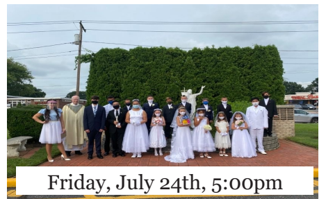
Friday, July 24th, 5:00pm