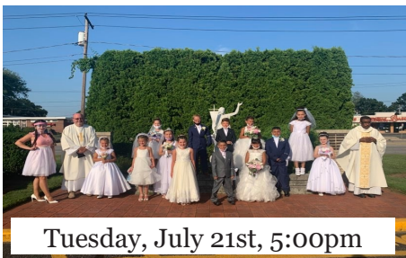
Tuesday, July 21st, 5:00pm