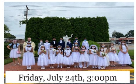
Friday, July 24th, 3:00pm