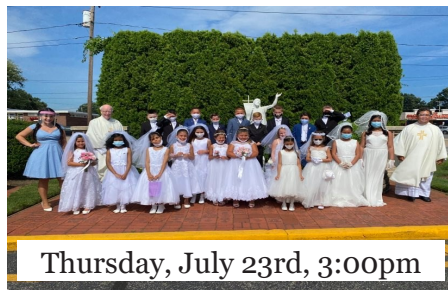
Thursday, July 23rd, 3:00pm