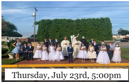
Thursday, July 23rd, 5:00pm