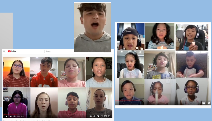
"Voices of Hope" SS Cyril and Methodius School Virtual Concert